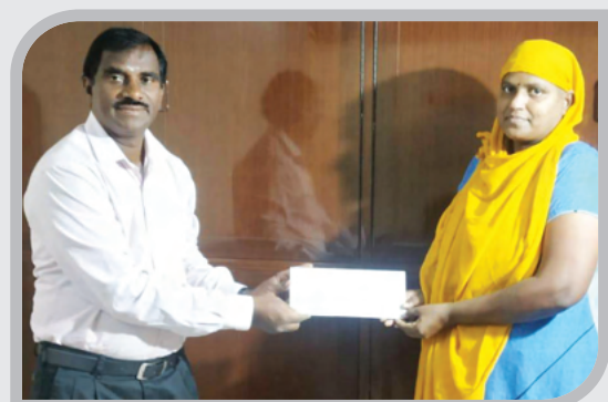
Village Health Nurse is getting Financial assistance for her Cancer Treatment.