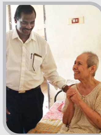
Enquiring and Counseling elderly Palliative Care Patient