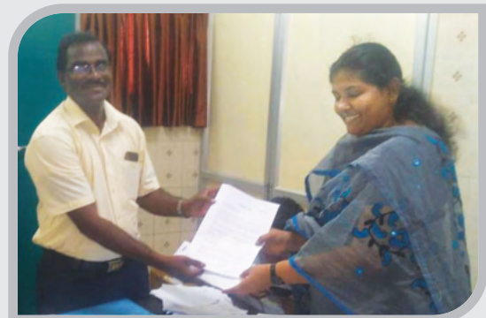
Acknowledgement letter received from the Block Medical Officer